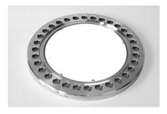
Thin Flange 6.00" CF with conductive glass backed phosphor screen mounted in the flange aperture. Small tabs secure the screen and conduct charge from the screen to the flange and then to ground.

The Thin Flange-Mounted Phosphor Screens come in 2.75" CF, 4.50" CF and 6.00" CF flange sizes. Screens for 8.00" CF are available as a special option. All Thin Flanges are 0.4 inch thick, double-sided (knife-edges on both sides), and have double-density clear bolt holes. Please refer to the "Thin Flange" specifications in the