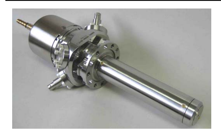
FC-86B Faraday Cup