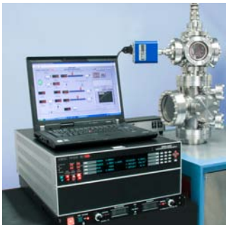
A typical lab set-up of a complete Kimball Physics system with power supplies, electron gun, and optional computer control system