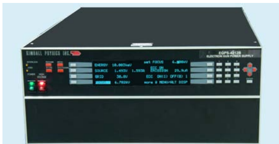
EGPS-4212A Electron Gun Power Supply with FlexPanel controller

The gun features an adjustable cathode feedthrough assembly that allows the mechanical alignment of the firing unit with respect to the anode and the column. This alignment can be done in real time while the gun is operating at full voltage with beam on. Various stand-alone designs of Faraday cups are available.