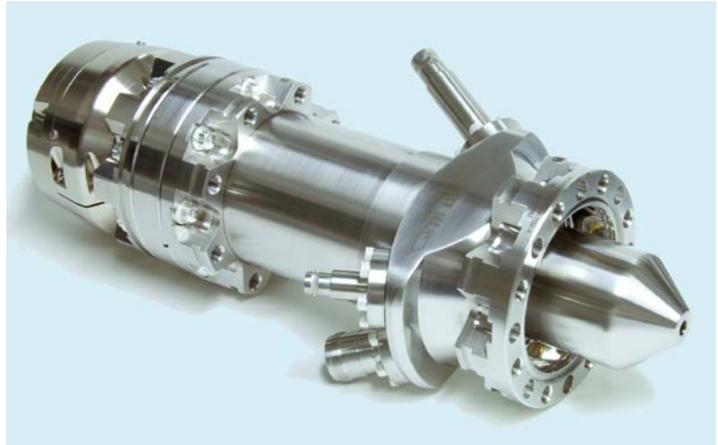
EMG-4212A Electron Gun with 4 1/2 CF mounting flange

UHV technology is used throughout. The gun can be run in vacuums from 10^{-11} torr up to 10^{-5} torr for the standard Ta disc cathode. The electron gun is bakable to 350°C with cables removed.